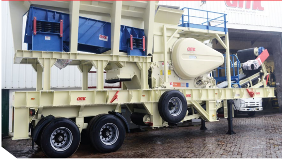
PRIMARY GROUP C106