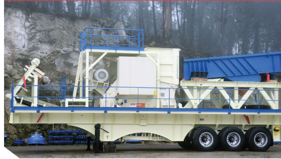
PRIMARY GROUP C125