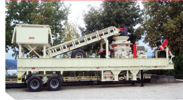
SECONDARY GROUP HP200