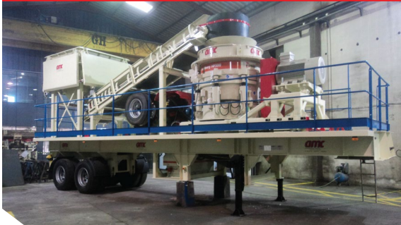
TERTIARY GROUP HP300